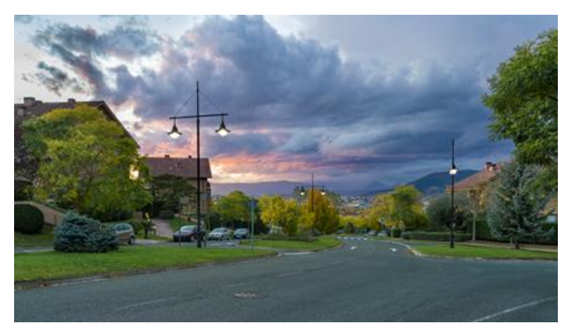
Gorraiz (Valle de Egüés - Pamplona) - Photograph courtesy of ATP Iluminación

Among all actions funded, we take as an example the ones of two specific city councils: the City Council of Valle de Egües-Eguisibar (Pamplona) which carried out a comprehensive replacement of its outdoor lighting, including the modernisation of all control panels as well as the implementation of centralised management systems; and the City Council of Valencia, which undertook global action to improve the energy efficiency of its municipal public lighting system, carried out in 2 stages.