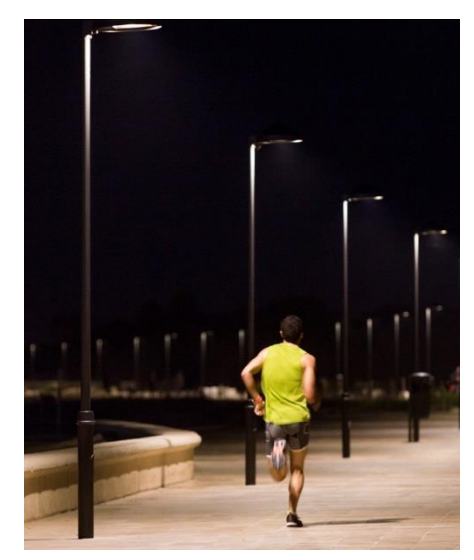
Paseo Pinedo (Valencia)

In May 2015, the Institute for Energy Diversification and Savings (IDAE), a body attached to the Spanish Ministry for Ecological Transition and the Demographic Challenge, set up the aid programme for the improvement of municipal lighting facilities, aiming to reduce their final energy consumption and CO_2 emissions. Therefore, a funding line is established, on reimbursable loan basis, so that local entities can renovate their outdoor lighting systems taking energy efficiency criteria into account.