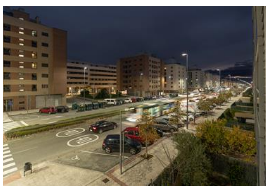
Sarriguren (Valle de Egüés)