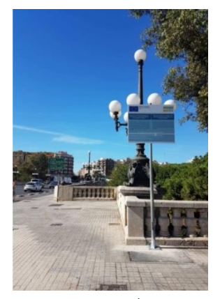
Permanent plaque Puente Ángel Custodio -Valencia