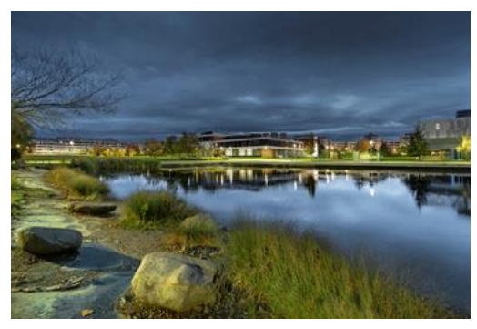
Ayuntamiento Valle de Egüés

The actions carried out in Valle de Egües-Eguesibar stand out for the excellence of the engineering works , with a very detailed approach, studying the specific needs of each section of the street and specifying point by point which luminaires were more suitable. Thanks to this action, innovation was enhanced , with the collaboration between the different actors involved —the company in charge of engineering and the manufacturer—, who managed to adapt the product to the needs of the population.