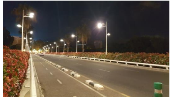
Paseo de las Flores (València)

At a European level and in line with the maximum commitment to the urban regeneration of their cities, both city councils led Smart Cities projects within the framework of the HORIZON 2020 Programme of the European Commission . Therefore, both Valencia (MAtchUP Project) and Pamplona (STARDUST Project) have an essential role as Lighthouse Cities, implementing exemplary and replicable actions aimed at achieving smart cities in which large-scale demonstration projects of innovative technologies in the energy, mobility and ICT sectors are carried out.