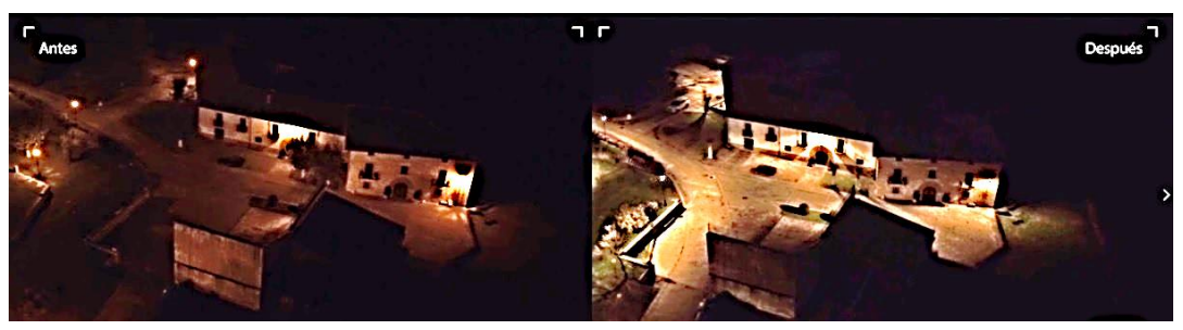
Ustarroz Council before and after the renovation

The street lighting of Valle de Egües-Eguesibar was initially made up of 4,316 luminaires. Large part of them was located in the Eco-city of Sarriguren (2,523) and Gorraiz (638). In the case of Sarriguren, many low-height luminaires were turned off to achieve some energy savings due to inefficient lighting. In contrast, in other towns such as Gorraiz, the lighting was very poor, with low levels of lighting due to its urban design. In many cases, the luminaires were older than 25 years, being obsolete and lacking adequate saving and protection measures.