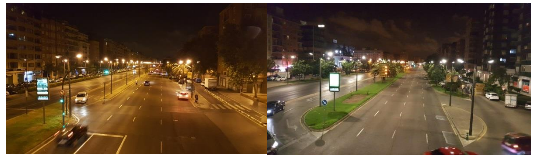
Cid Avenue before and after the renovation, Valencia

The city's public lighting was made up of a park with more than 107,000 street lights, which in 2015 had total installed power of over 25 MW. It was outdated equipment, which had not been renovated since 1990, which led to high energy consumption and consequently a high rate of CO_2 emissions, as well as high light pollution. The facility had outdated, low-light output luminaire models, which also involved high operating costs for the facility, particularly energy costs. This fact implied an inefficient use of the installations, with streets with inadequate light levels for both excess and defect.